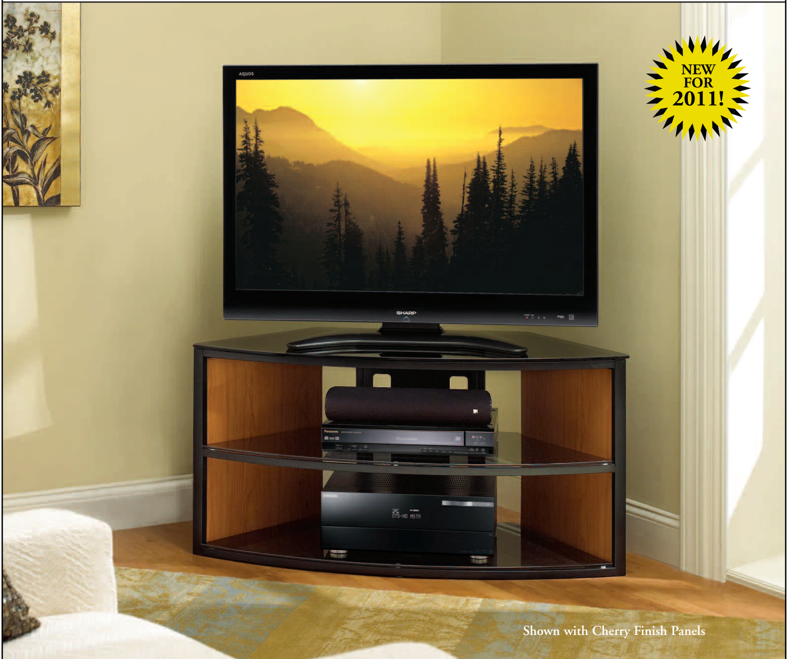
Shown with Cherry Finish Panels