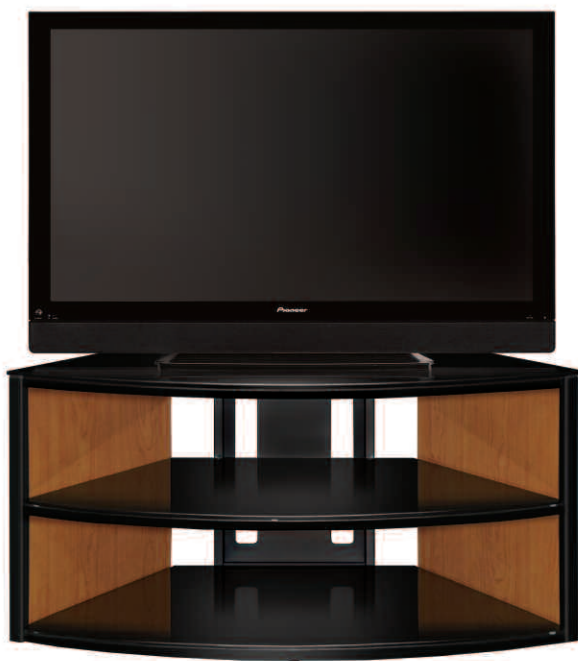
Shown with Cherry Finish Panels