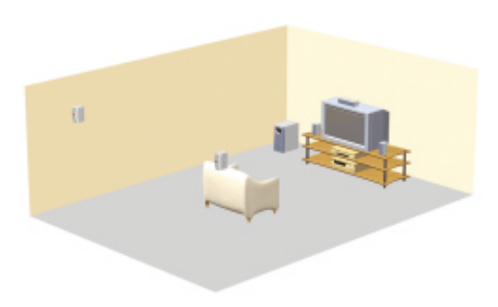
The NS-P100 5.1-Channel Speaker Package constructs 4 satellite (main L/R and rear L/R), centre and LFE (Low Frequency Effect i.e. subwoofer) channel speakers.

This speaker package is designed for use in a 5.1-channel (6-speaker) system. This configuration allows Dolby Digital and DTS movie sound formats to be enjoyed at their full potential. The speakers' high performance capabilities ensure accurate reproduction of DVD and other high quality sound sources, as well as of Yamaha's dynamic and realistic CINEMA DSP sound.